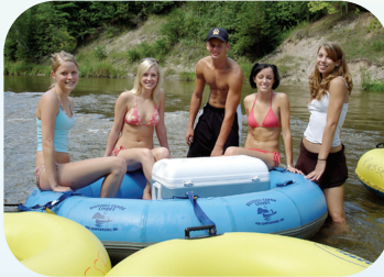
4 Person Tube