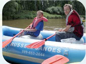
6 or 8 Person Raft