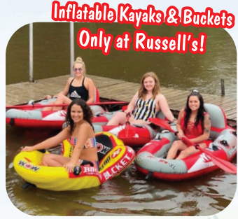
Inflatable Kayaks & Buckets